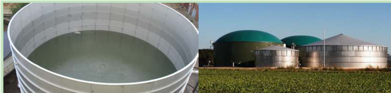
Figure 7: Interior view of stainless steel storage tank (left) and exterior view of storage and digester tanks 6

As well as being used to make the digester, the manure, water and residue storage tanks also utilise stainless steel. Digester tanks are often covered by insulation, as shown in Figure 7.