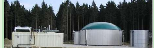
Figure 12: Frankfurt Hahn Airport's co-generation plant showing a pre storage tank (top left), external view of the plant (bottom) and inside of a tank (top right) 11