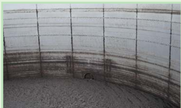
Figure 6: Inside view of a stainless steel digester tank after operation 5

Stainless steel has many advantages in this application including: