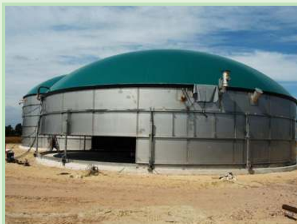
Figure 5: Construction of a stainless steel digester tank 4

Stainless steel reduces construction time and logistic costs. It has excellent corrosion resistance against H 2 S or ammonia and this makes maintenance easier.