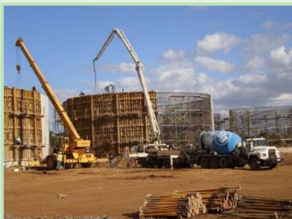
Figure 3: Construction of concrete digesters in typical biogas plant

Concrete is currently the most widely used material to build digesters because of its cost advantages and flexibility.