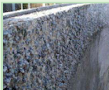
Figure 4: Inside view of a concrete digester after operation

During operation, regular maintenance is very important to prevent leakages. Leakages of gas, water and odour from a digester can cause serious problems for the plant. It is hard