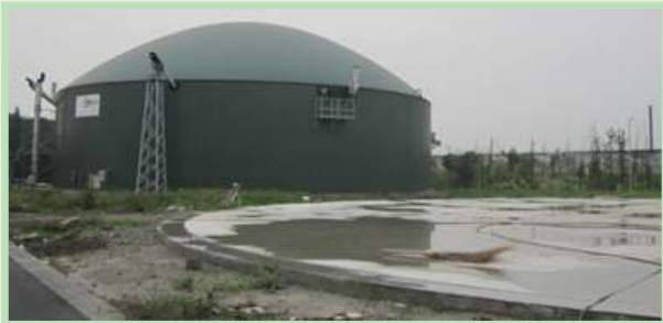
Figure 11: Digester tank in the Wuxi Kaipu CNG System 10

In China, it is not yet common practice to feed privately generated energy into the electricity grid. The usual approach is to either generate bio-methane and use it directly, or to use the generated energy directly.