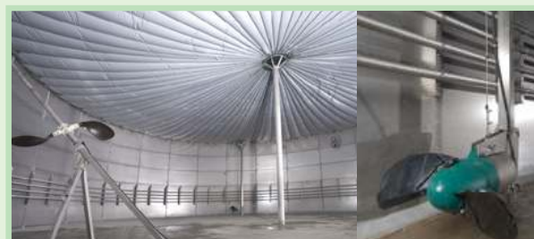
Figure 8: Inside view of a stainless steel digester tank 7

Stainless steel is utilised for pipes and fittings in biogas plants for its corrosion resistance and excellent formability. Its heat-transfer coefficient is also better than that of plastics. Grade EN 1.4404/AISI 316L is preferred for these applications.