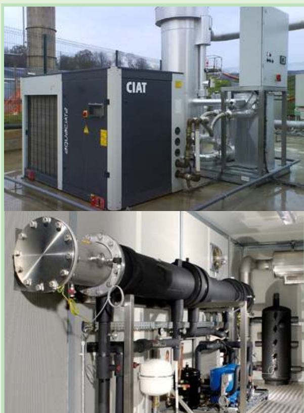
Figure 9: Examples of biogas dehumidifier systems 8

In most cases, the dehumidification process takes place before the hydrogen sulphide is removed. Stainless steel (grade EN 1.4404/AISI 316L) is often used for the parts of dehumidifier systems which come into contact with wet biogas as it can withstand the corrosive effects of the hydrogen sulphide it contains.