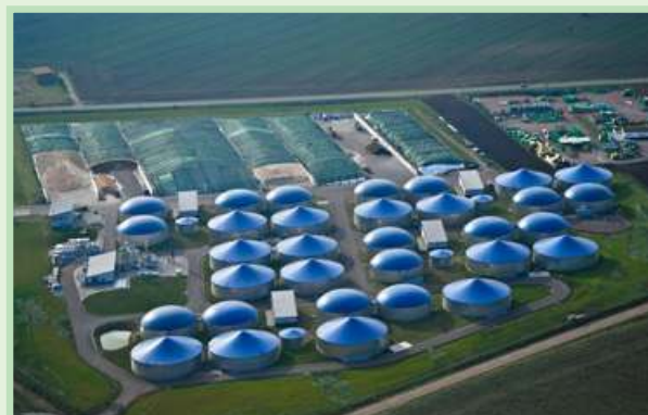
Figure 10: Aerial view of the Saxony-Anhalt biogas plant 9

The plant produces up to 15 million cubic metres of biological natural gas each year which is refined from raw biogas. The digester tanks are made of stainless steel grade EN 1.4301/AISI 304.