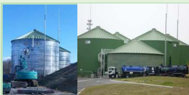
Figure 14: Stainless steel digester tanks at the Shinko Bio Arc 13

The Shinko Bio Arc Project in Japan was completed in 2011 and is operating commercially. The main purpose of this project is to create a closed recycling loop within the food production and disposal chain.