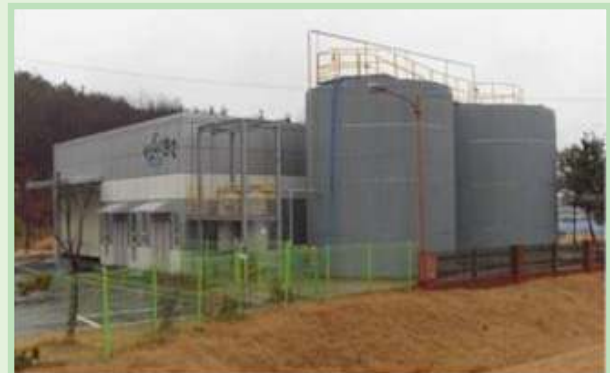
Figure 13: Bousung Biogas Plant 12

The Korean government is promoting biogas production and several biogas plants were established before 2010. Plant makers are classified into two different groups depending on the scale of production. Big companies, which have relatively large biogas plants, process food waste from big cities. Several government departments also have plans to introduce up to 500 biogas plants.